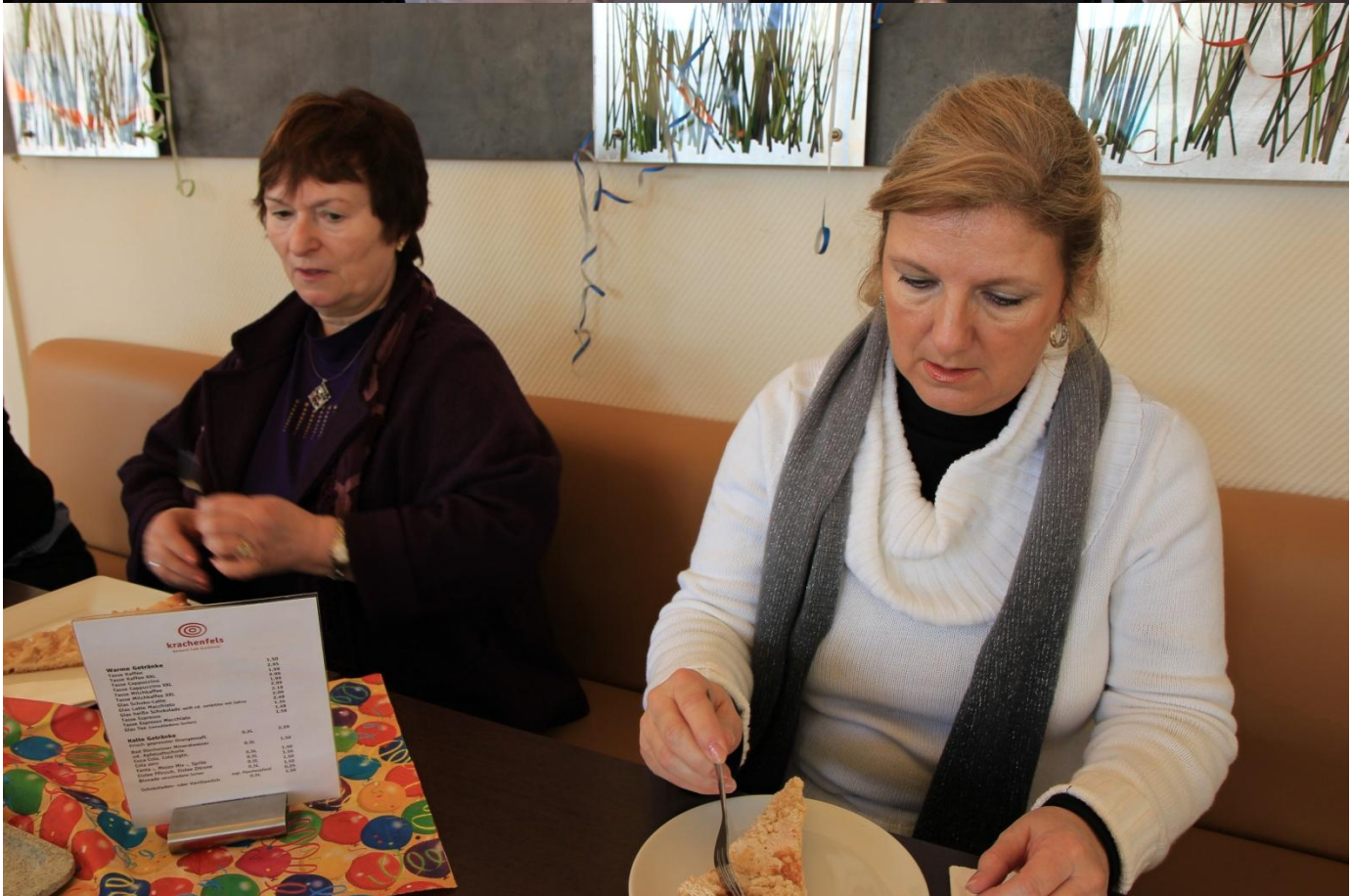
A Quick Stop in Epfendorf Coffee shop full of German pastries, with our German friends